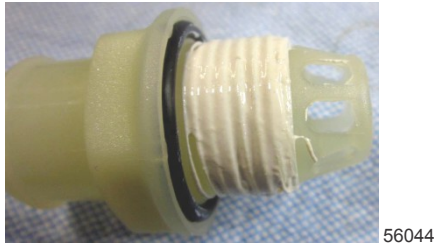
CAC strainer fitting with lubricated threads