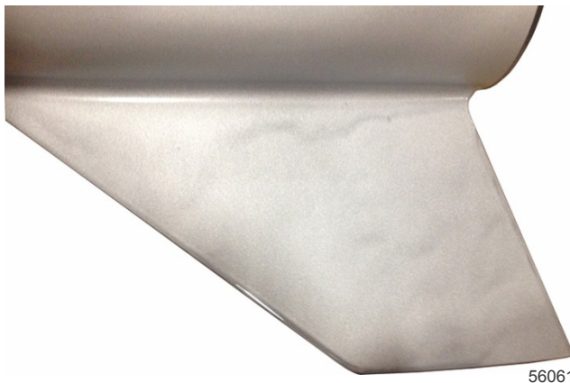
Single heavy wet coat

NOTE: The following examples show the results of repainting a skeg with a single heavy wet coat versus two light dry coats.