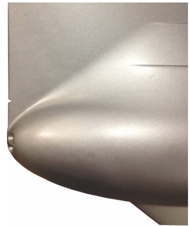
Paint appears flat after 20 minutes of drying time