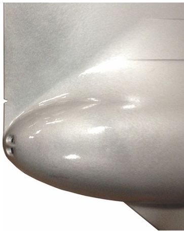
Paint appears shiny immediately after touch up