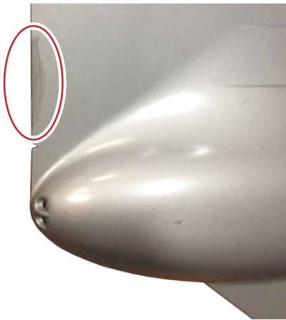
Damage to leading edge