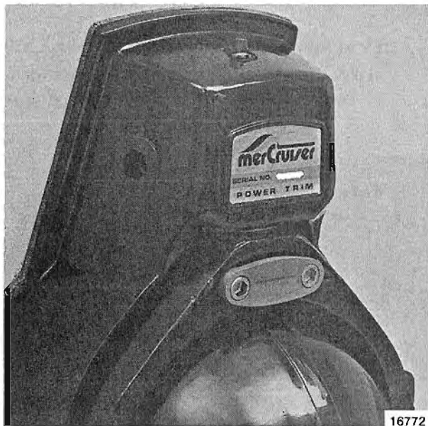
Figure 2. Clamp Bracket Kit (41456A1) Installed

Future TR/TRS transom assemblies will be equipped with a gimbal ring utilizing a U-bolt at the top connection. (Figure 3) This gimbal ring also will be used in Swivel Shaft Kit (42385A3) and Gimbal Ring Assembly (42385A1).