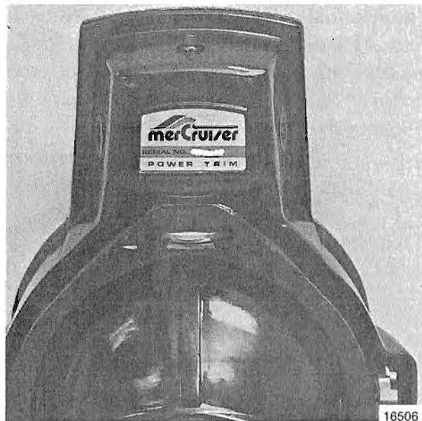
Figure 3. U-Bolt Style Gimbal Ring

Swivel Shaft Kit (93305A1) and Gimbal Ring Assembly (93304A2) will be superseded to the aforementioned parts. If you have any of these items in your inventory, return them to your Mercury Marine Parts Distribution Center for credit. List the parts being returned on a warranty claim.