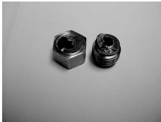
a - Area of crack