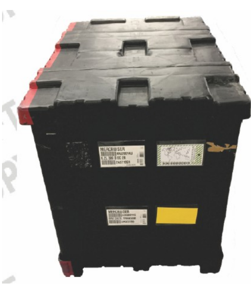
Top angle front end

Photos will be required by all freight carriers when filing a freight claim. Photos should be taken of the crated engine, and uncrated engine. Photos required are as follows: