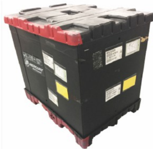
Front end left side