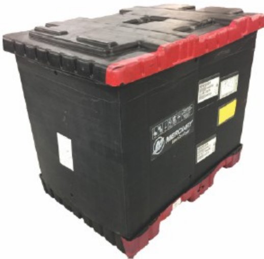
Rear end right side