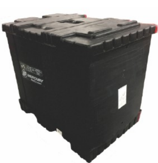
Rear end left side