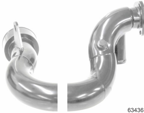
Example of destroyed high riser

NOTE: If the bulletin required removal and replacement of the item, except the ECU, it must be destroyed.